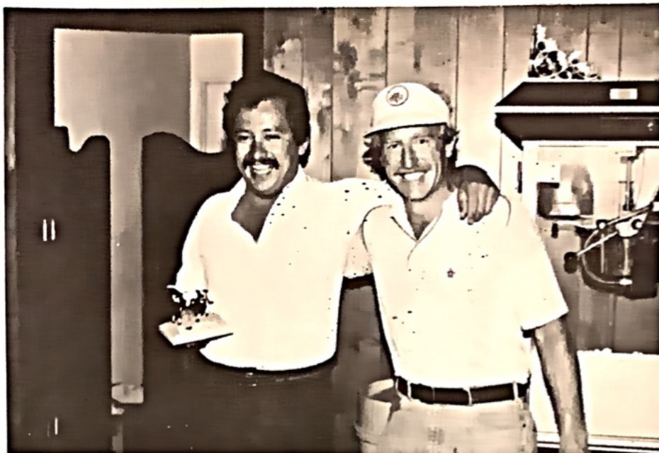
THE "HORSE" AND HIS PARTNER