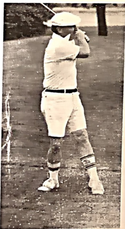
GOOD GUYS WEAR WHITE !