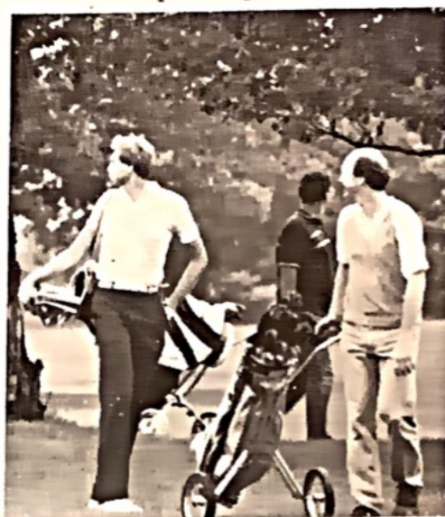
HE'S USING HIS PUTTER ?