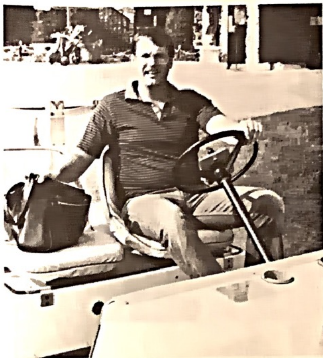
THIS GAME'S EASY