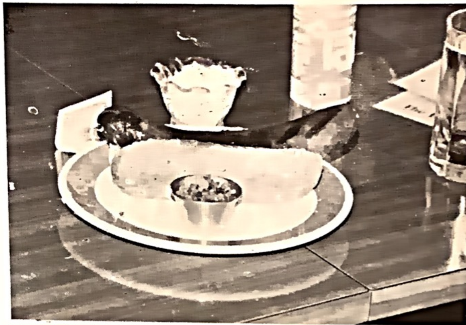
THERE ARE BIGGER HOT DOGS AROUND