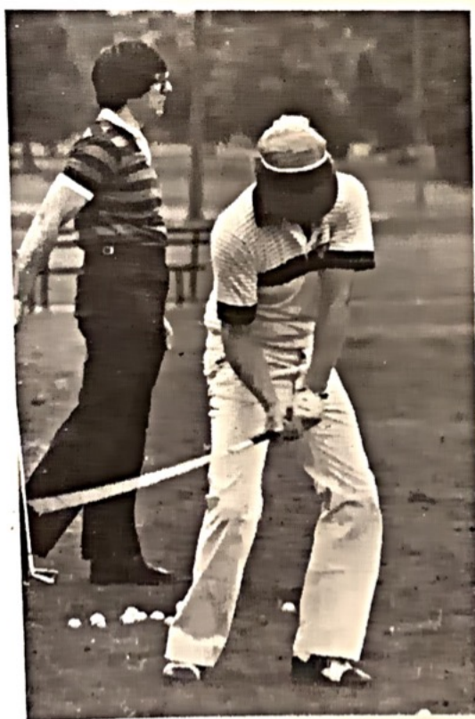
WORKING HIS WAY BACK