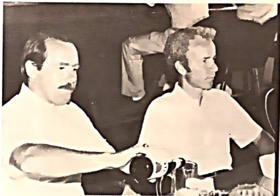
IT'S MILLER TIME !