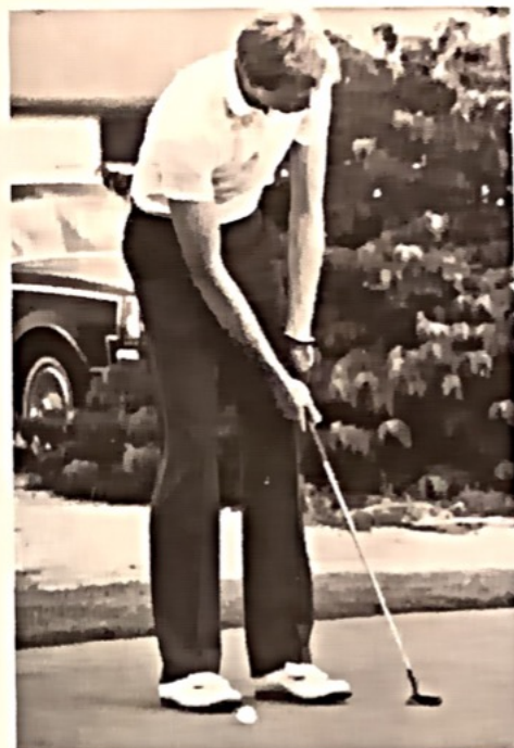
LONGEST PUTTER IN THE LEAGUE !