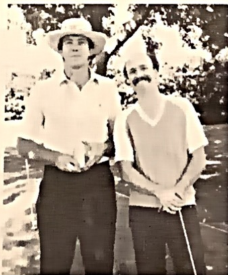
WHERE'S THE BANANA BOAT ?