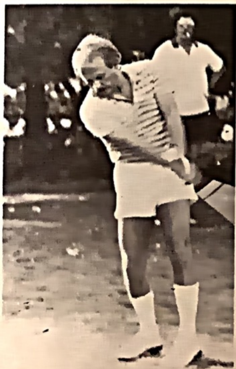
NICE LEAN, STIK