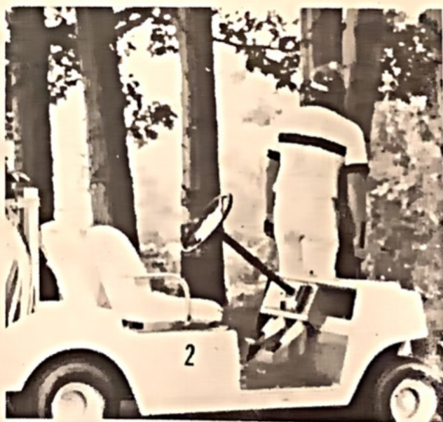
WHERE'S MY TREE WEDGE ?