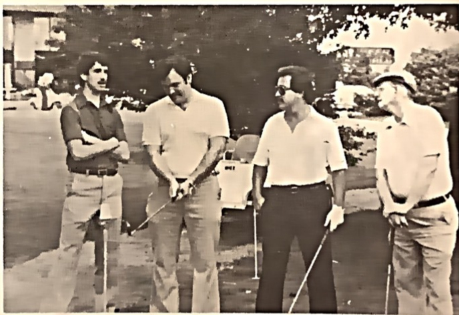
I'D SURE LIKE TO HIT A GREEN TONIGHT !