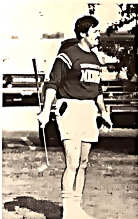
GO BLUE !