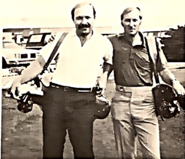
WHOSE BAGS ARE WE CARRYING TONIGHT ?