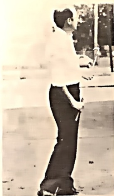
WATCH OUT IN THE PARKING LOT !