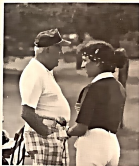
THE OLD GUARD AND THE NEW WAVE