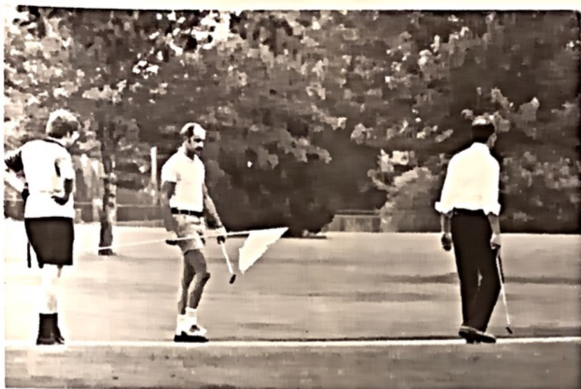
DON'T DO IT FRED !