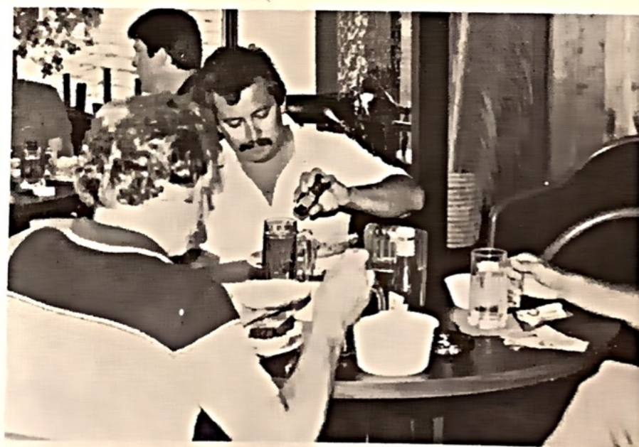
A POTENT PAIR