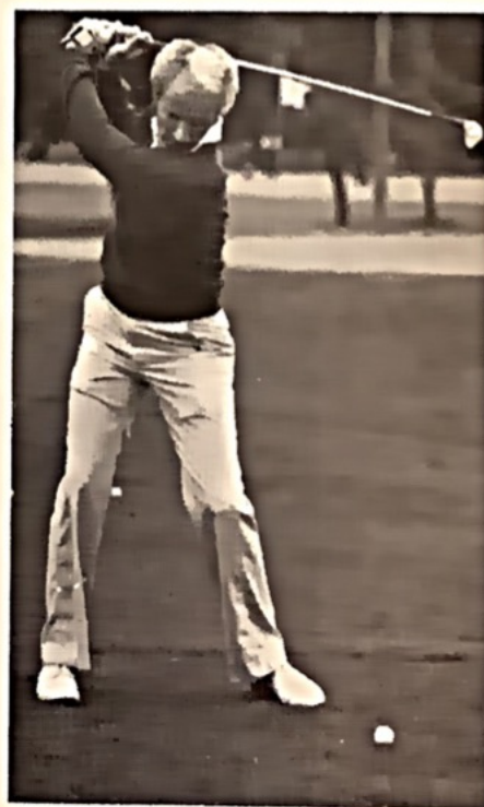
THE CASH SWING