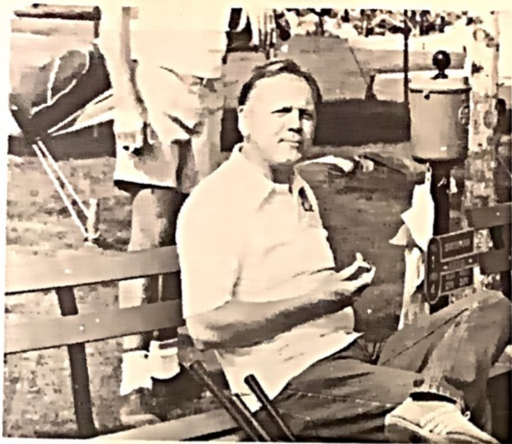
THERE'S PART OF THE PROBLEM