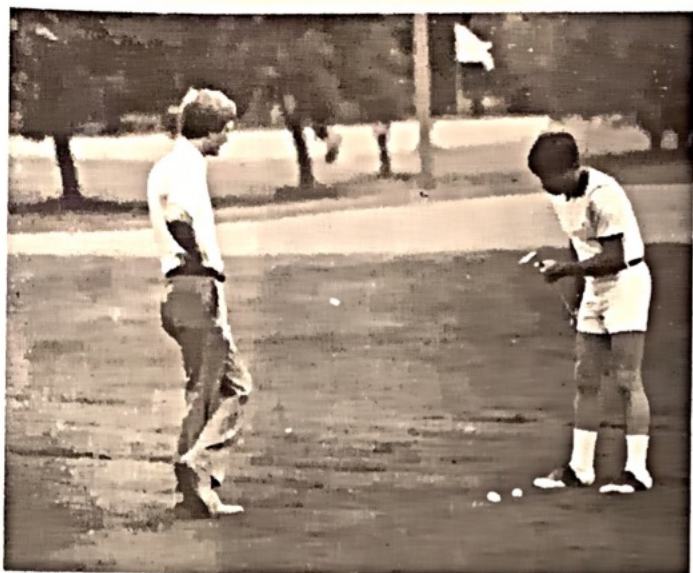
YOU DON'T THINK I SHOULD USE MY PUTTER ?