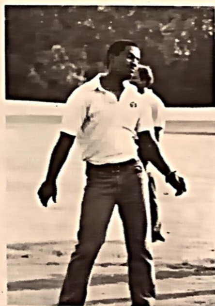
I GOT RYTHYM!!!