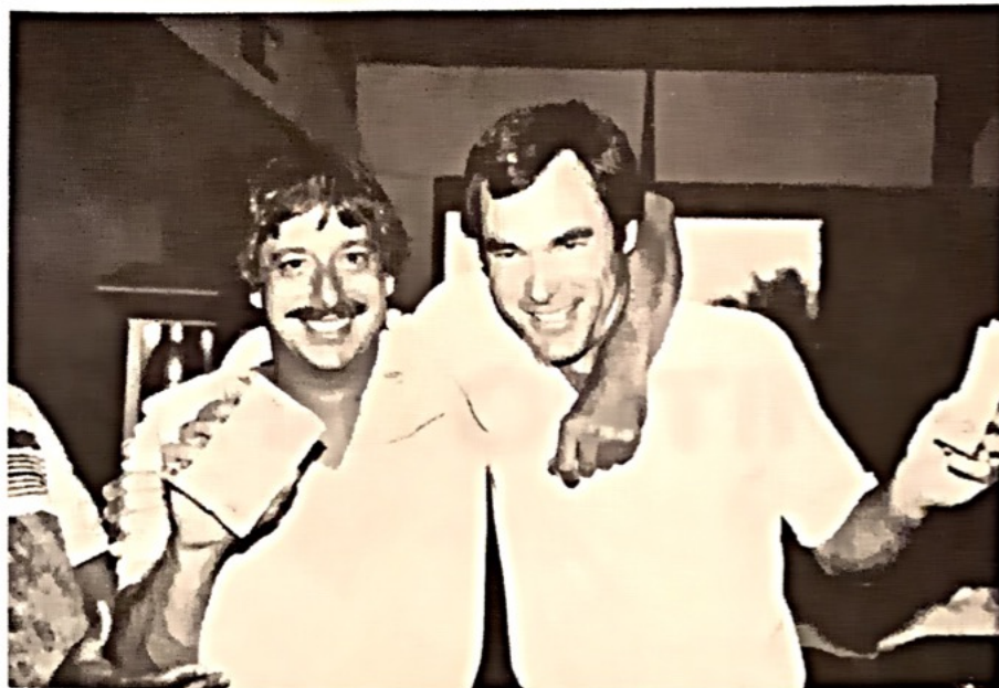
"2 MAN" SCRAMBLE WINNERS