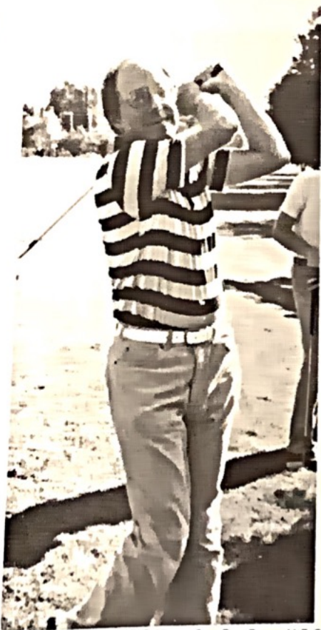
1, 2, 3, KICK, 1,2,3, KICK