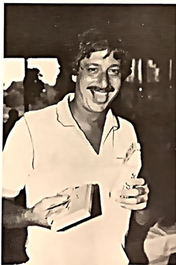
DO YOU BELIEVE IT ?