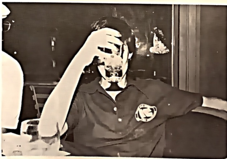
ELLWOOD ! ! ! !