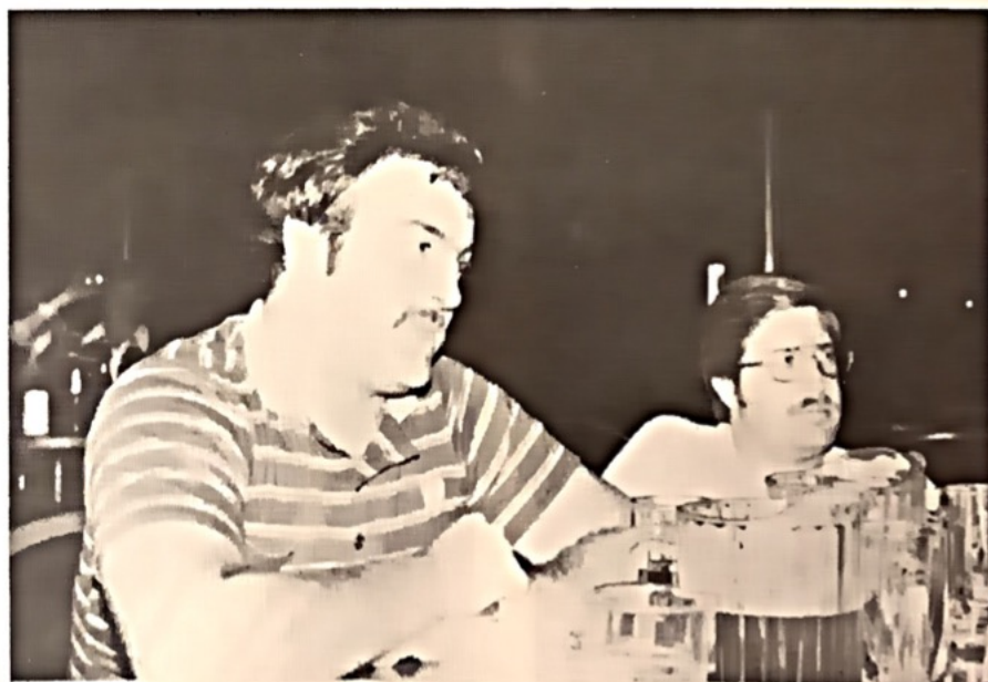
MONDAY NIGHT BASEBALL OBSERVERS