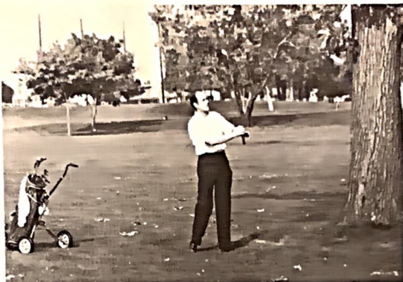
THAT CAN'T BE BOB'S BAG