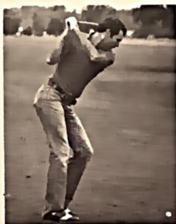
GREAT FORM, (MUST BE A PRACTICE SWING)