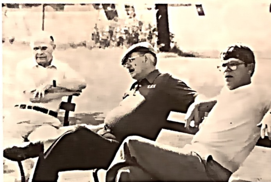
THE PINE BROTHERS