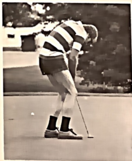
A LITTLE HINDSIGHT