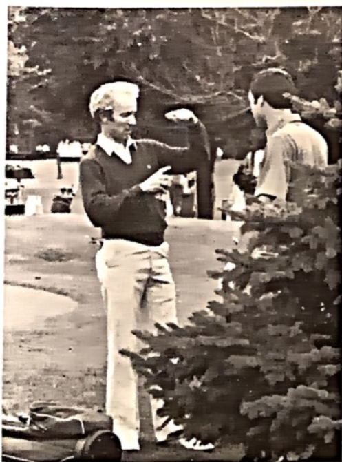
DON'T TEE IT THIS HIGH JACK !