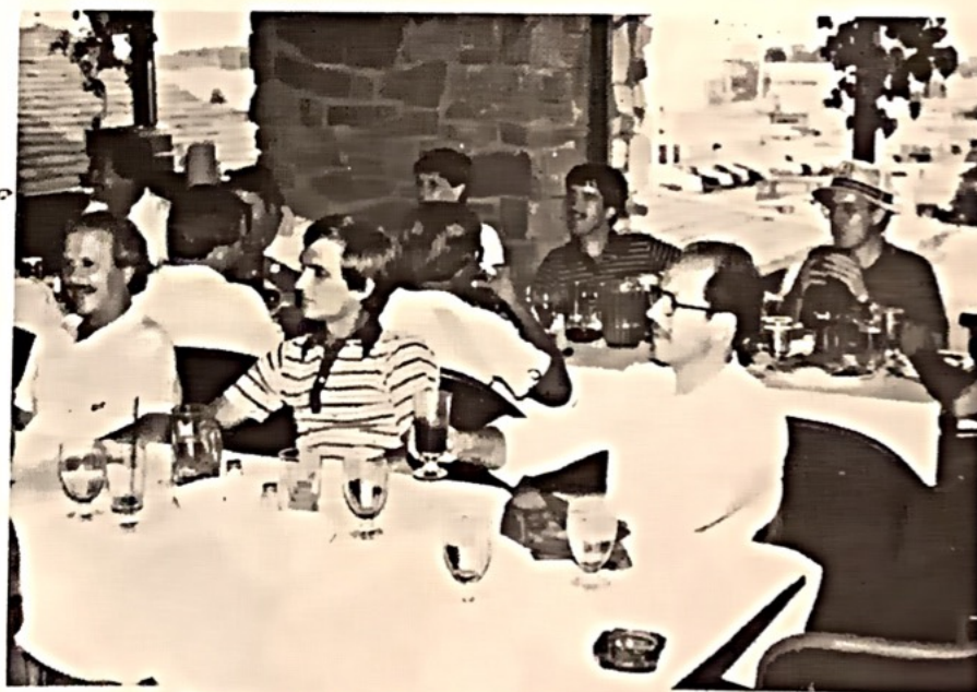
ROUGH DAY IN THE LAB, HEY RO ?