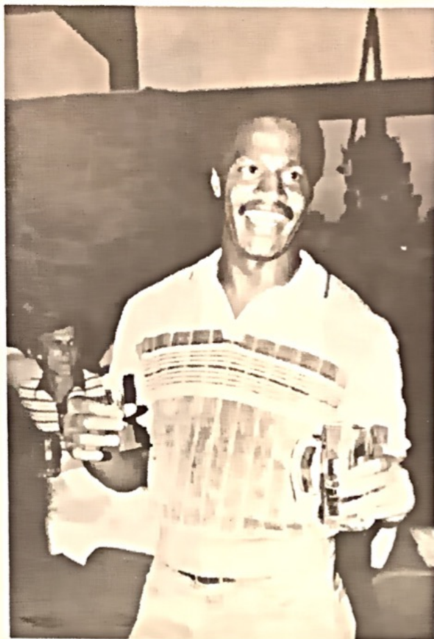
THE "DEBBIE" AWARD